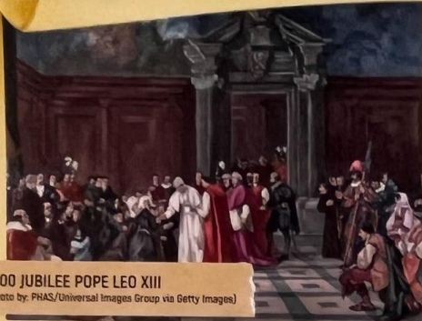
1900 JUBILEE POPE LEO XIII

THE VOICE OF PADRE PIO www.vocedipadrepio.com