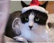
"Uh... I'm Jewish."