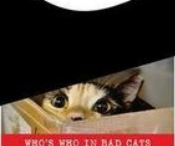
WHO'S WHO IN BAD CATS