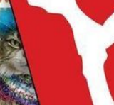
"Can you tell me whose it is?"