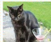
"Could somebody please bring me the wastebasket?"