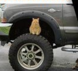
"We both think you should walk."