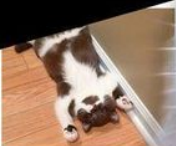
"I surrender! Okay, okay, unconditional surrender."