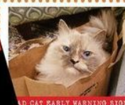
READ CAT EARLY WARNING SIGN