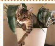
"You said you didn't have a pot to piss in. Now you're in."