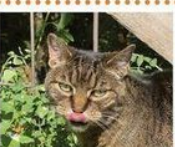
"Took care of the chipmunks for you."