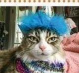
"I can tell you're dying to see what's in my will."