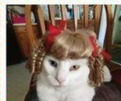
"Which of my tiresome gentleman callers is it this time?"