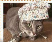
Cat bores owners with same story of harrowing journey across the Atlantic.