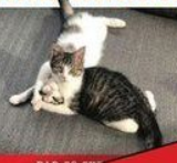
BAD TO THE BONE