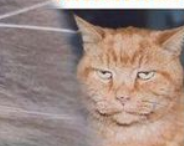
"I love it, I'm a cat."