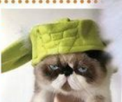
"With or without you, I'm heading back to the wine cellar."