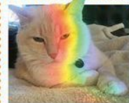
For sixth straight year, cat auditions for the rainbow in The Wizard of Oz.